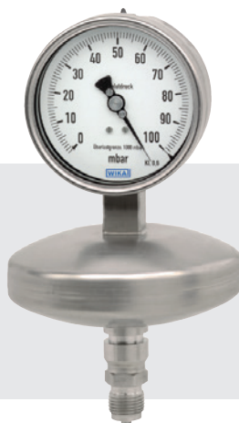
Model 532.51 – 532.54